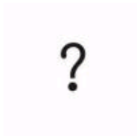
Where are they now ?