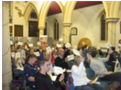
Inclusion Awareness Workshops & Training

The workshops are delivered in a fun and interactive way, allowing participants the chance to network with other people who have an interest in wishing to make their leisure setting more inclusive to disabled children and young people